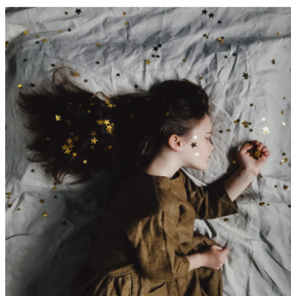
11 tips to sleep better at night